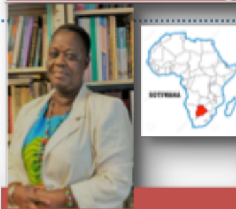
"Widowhood, Rituals, and Healing in Botswana"