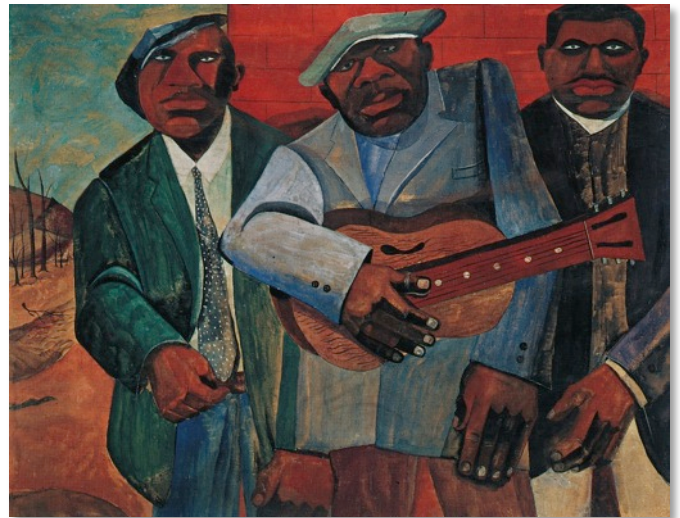
Romare Bearden, Folk Musicians , c. 1942, gouache with ink and graphite on brown paper