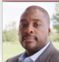
"The Black Panther Party in Israel and Palestine"